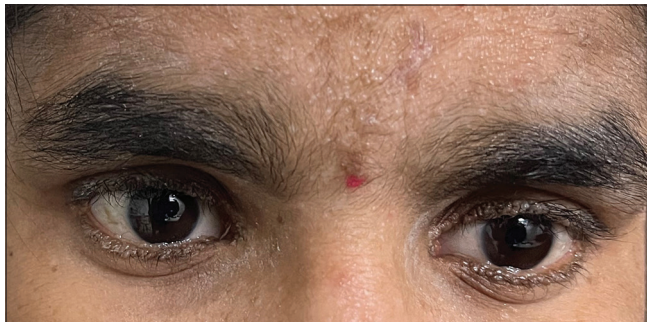
Figure 1: Moniliform blepharosis.

In our case, she had blisters since the age of 8 years for which she had sought treatment from a dermatologist, eventually seen as healed scars.