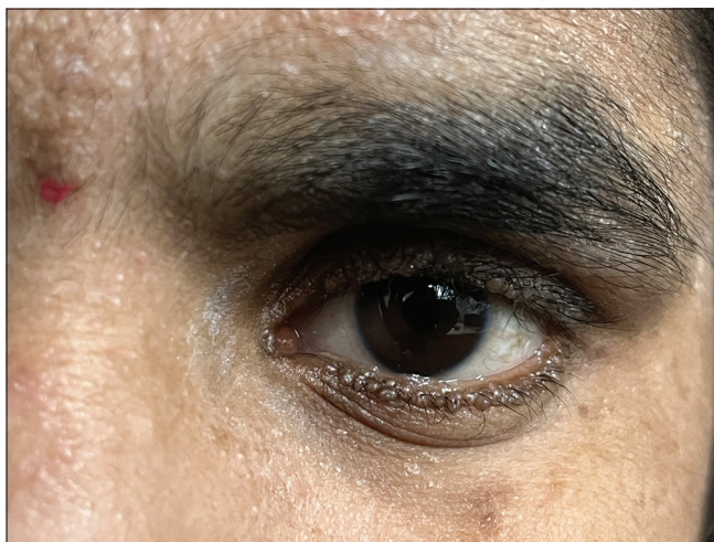
Figure 2: Lesions resembling string of pearls.