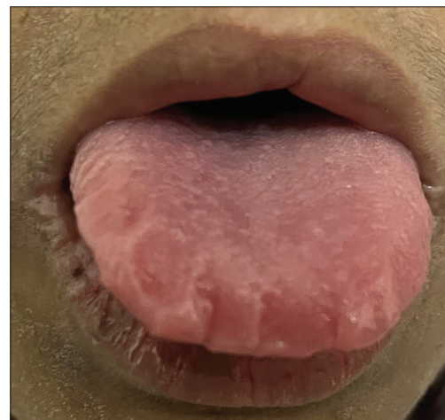
Figure 4: Thickened tongue.