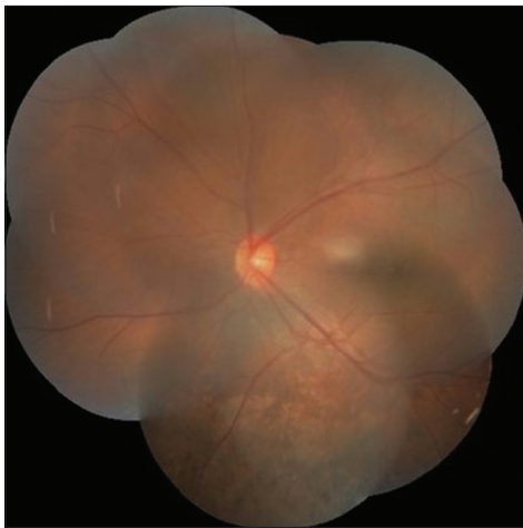
Figure 3: Montage photograph showing normal disc features along with chorioretinal lesion in periphery in the left eye (OS).

that the paternal grandaunt could not conceive as well as the paternal grandmother had only one child. Hence, we suspected the patient to have HED and went ahead with