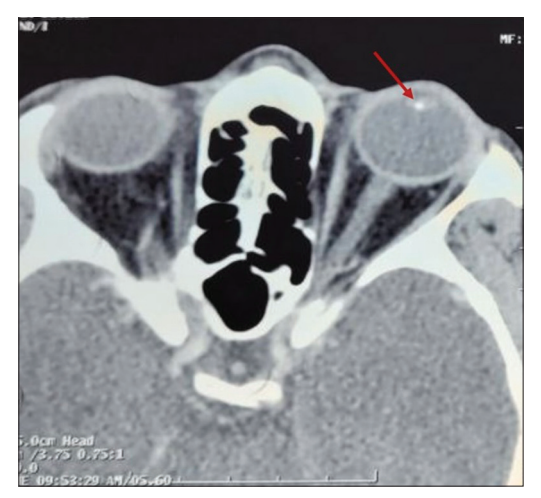
Figure 2: A computed tomography scan (axial section) of the orbit shows a hyperdense foreign body embedded in the lens matter (red arrow).