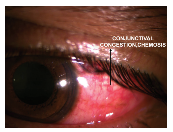
Figure 1: Conjunctival congestion and chemosis (black arrow).

Goldmann applanation tonometry was found to be OD- 60 mm Hg and OS- 50 mm Hg. Anterior segment evaluation revealed diffuse conjunctival congestion [Figure 1], significant chemosis, shallow anterior chamber (AC) OU. Pupil was central, circular, sluggishly reacting to light. Posterior segment evaluation revealed normal fundus. Gonioscopy revealed occludable angle OU. Axial length measured for both eyes was found to be 22.86 mm and 22.85 mm. Ultrasound biomicroscopy (UBM) done revealed ciliochoroidal effusion in both eyes [Figure 2]. He was administered 350 mL of 20% IV Mannitol and two tablets of 250 mg acetazolamide stat. He was then continued on 250 mg acetazolamide BD for three days. He was also started on eye drops 0.5% Timolol 1 drop BD, 0.2% Brimonidine 1 drop TDS, and 1% Brinzolamide TDS. The rest of the treatment was discontinued. On day two of treatment, his IOP settled to 11 mmHg OU. BCVA was 6/6 OU with the same refraction. The patient was followed up regularly and on day seven, his UCVA was 6/6 OU, IOP 10 and 11, respectively, without anti-glaucoma drugs. Anterior and posterior segment evaluation was within normal limit (WNL). On day 14, the patient again reported this time with right eye