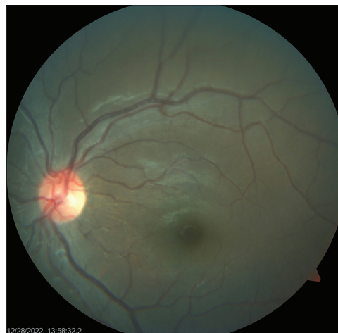
Figure 2: Left optic disc photograph showing temporal pallor.

The World Health Organization classification recognizes three subtypes of NPC. Type one is Keratinizing, type two is non-keratinizing, and type three is undifferentiated squamous cell carcinoma. Distant metastasis to bone,