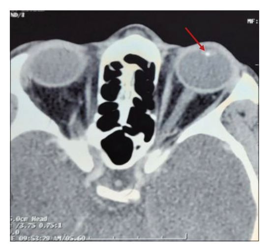
Figure 2: A computed tomography scan (axial section) of the orbit shows a hyperdense foreign body embedded in the lens matter (red arrow).