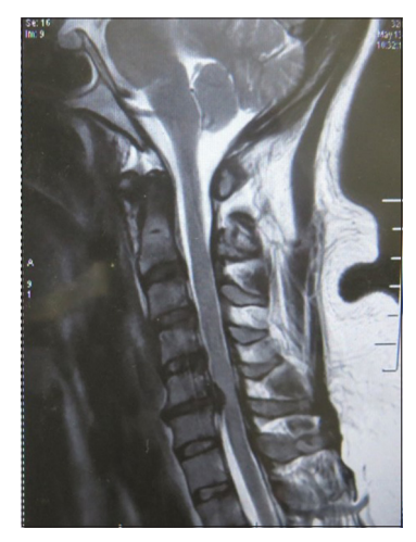
Figure 4: Cervical compression at the level of C5-C6.

radical neck dissection, internal carotid artery - dissection, thrombosis, and invasion by tumor.