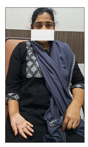
Figure 1: Right-sided birth defect of upper limb and right-sided ptosis.